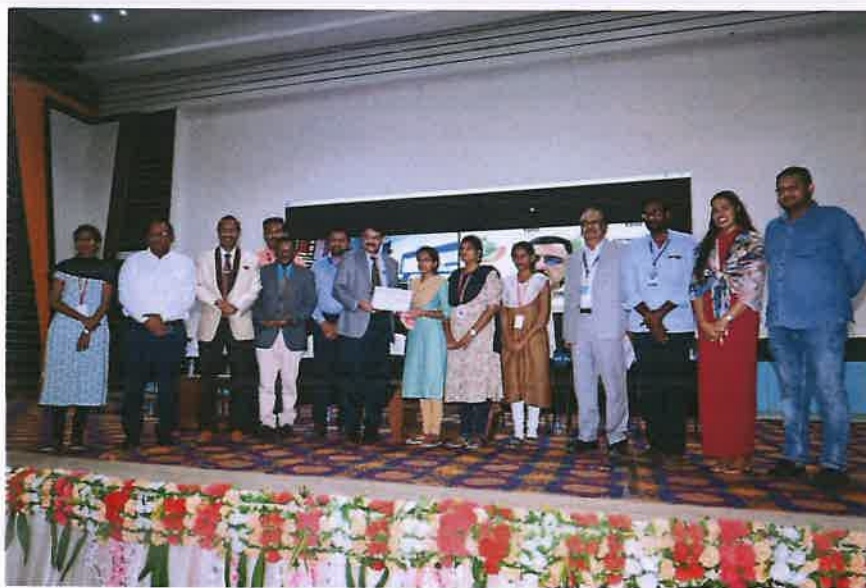
Student received project First prize in EDII program, Ahmedabab